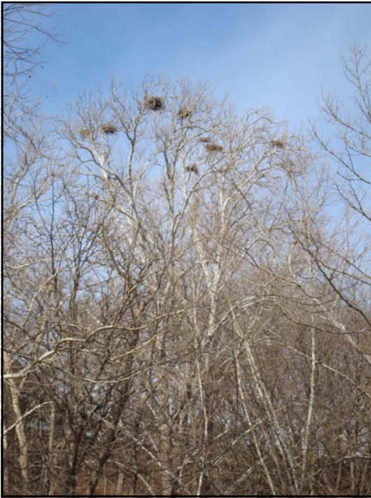
Rookeries spotted at Gans Creek Recreational Area