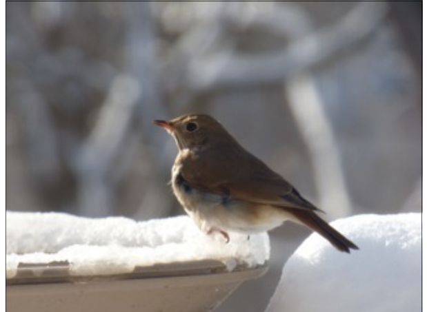
Hermit thrushes seen at Lottie Bushmann's heated birdbath

Of the 29 bird species sampled during the "crawl," the bird of the day was a beautiful Hermit Thrush who twice visited the heated birdbath at Lottie's home. Other highlight birds were Red-shouldered Hawk, Purple Finch, Fox Sparrow and White-crowned Sparrow. After we were all "crawled-out," the final species checklist for each location was submitted to eBird. The bird counts CAS contributed went into a global data pool that helps scientists create an annual snapshot of the distribution and abundance of wild birds.